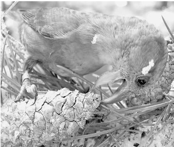
Figure 1. This shows a male type 9 or South Hills crossbill biting between lodgepole pine cone scales so that he can then laterally abduct (spread) his lower mandible to the side (see fig. 2). Crossbills generally forage near the distal end of the cones where most of the seeds are located.

Bill size, especially bill depth, determines how fast crossbills can remove seeds from between closed cone scales, whereas the structure of the horny palate of the upper mandible is critical for husking seeds (Benkman 1993). Crossbills have evolved bill and body sizes that are about two to three times larger than their redpoll-like ancestors. The large bill and associated musculature are critical for providing the necessary forces for spreading apart cone scales and extracting seeds from closed or partly closed cones. However, the conifer seeds that crossbills regularly eat are on average rather small. Thus, crossbills have evolved a horny palate structure that enables them to handle small seeds quickly (Benkman 1988). In particular, the lateral grooves in the palate of the upper mandible are narrower than in other cardueline finches, allowing crossbills to secure small seeds with their tongue while they crack and remove the seed coat with their lower mandible.