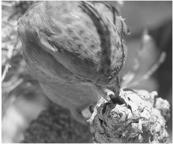
Figure 2. This shows a female type 9 or South Hills crossbill laterally abducting her lower mandible to spread apart the scales of a lodgepole pine cone. Her asymmetric jaw musculature enables her to exert strong abduction forces to spread apart cone scales, exposing seeds at the base of the scales.

of western hemlock ( Tsuga heterophylla ) (Benkman 1993). On the other hand, these type 3 or hemlock crossbills are very inefficient at foraging on seeds and cones larger and harder than those of Douglas-fir ( Pseudotsuga menziesii ). Hemlock crossbills should be rare in Colorado, and when found are likely to be associated with Engelmann spruce. I do not know of records from Colorado, but specimens have been collected in both New Mexico (New Mexico State University Vertebrate Museum) and Arizona (Monson and Phillips 1981).