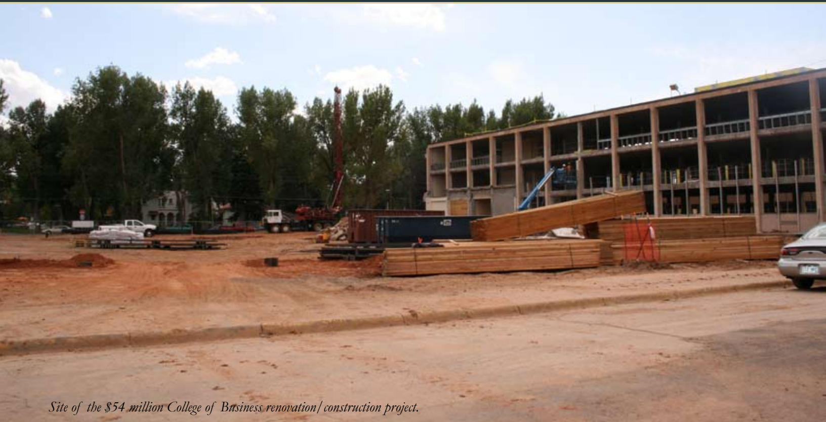
Site of the $54 million College of Business renovation/construction project.