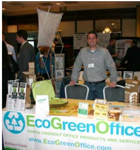
Beckett displays at CORE's SoSummit"

The goal is to be both the largest supplier of green office products and a consumer search engine connecting people with green companies nationwide, Olsen said. Of the thousands of products in the store’s catalog, the top sellers are the lifeblood of any office - paper and printer cartridges.