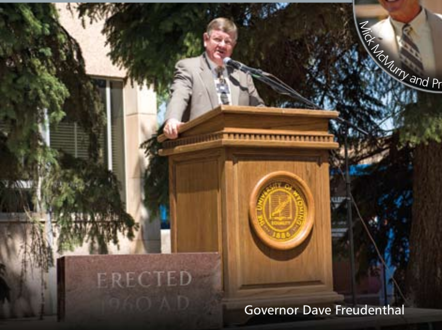
Governor Dave Freudenthal