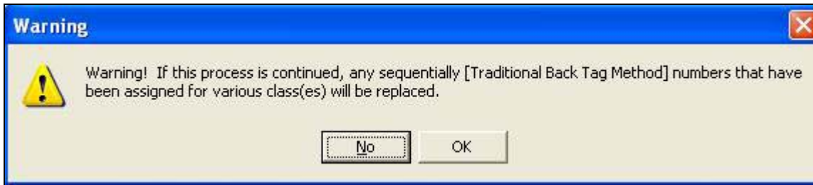
Figure 5. Sequential Numbers Replaced