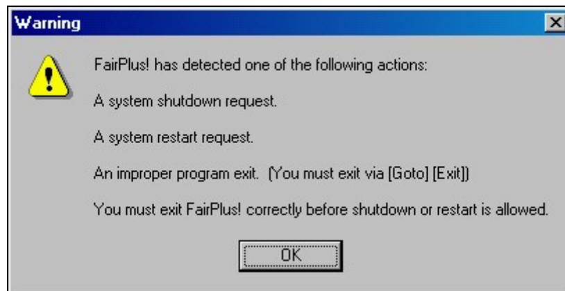
Figure 1. Shutdown Warning Message