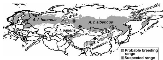
Fig. 1. Documented and suspected range of boreal owls in Eurasia. Subspecific boundaries are currently unclear, and widespread intergradation has been documented (Cramp 1985). Documented areas of hybridization or sightings of subspecies other than the one known to occur in an area are marked with asterisks. Range map is based on GIS coverages and other information amalgamated from multiple sources (Ripley 1961, Dement'ev and Gladkov 1966, de Schauensee 1984, Flint et al. 1984, Cramp 1985, Brazil 1991, Roberts 1991, Grimmer 1999, Kazmierczak 2000).

The ecology of boreal owls in Eurasia is extremely similar to that in North America. The boreal owl is a cavity nesting nocturnal owl, subsisting mainly on small mammals, in particular microtine rodents (Cramp 1985, Hayward et al. 1993). Boreal owls, in particular females and juveniles, often disperse long distances when microtine populations decline (Löfgren et al. 1986, Korpimäki et al. 1987, Sonerud et al. 1988, Hipkiss et al. 2002). This nomadic dispersal pattern is likely an adaptation to the regional spatial asynchrony in population cycles of microtine rodents (Mysterud 1970). A predicted effect of periodic nomadism is taxonomic homogeneity among boreal owls caused by high rates of gene flow (Mysterud 1970). Boreal owls showed no genetic differentiation across the boreal forests of North America and little throughout the subalpine forest as far south as southern Colorado (Koopman 2003). Because boreal owls on both continents exhibit such similar ecology and distribution, gene flow data collected in North America