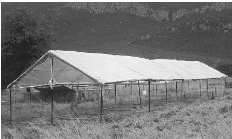
Fig. 1. Experimental system for capturing and redistributing precipitation. Each of 4 precipitation shelters (16 m \times 4 m) was covered with clear polyethylene film to exclude ambient precipitation from experimental plots. Ambient precipitation was stored in on-site tanks for later application to plots.

(SIRFER). \delta^{13}\text{C} values of leaves were used to calculate discrimination as