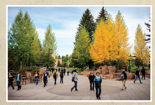
Prexy's Pasture, UW Campus