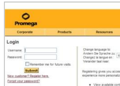
Login Web Page