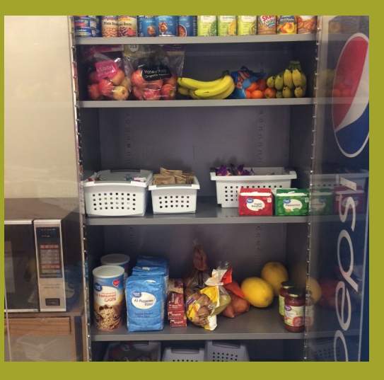
Corbett Building Maintained by Phi Epsilon Kappa (PEK) RSO Launched in September 2018 Contact: https://uwyo.collegiatelink.net/ organization/CHESNut

Fun Fact: Supported in year two by auctioned cowboy art made by RSO member's father