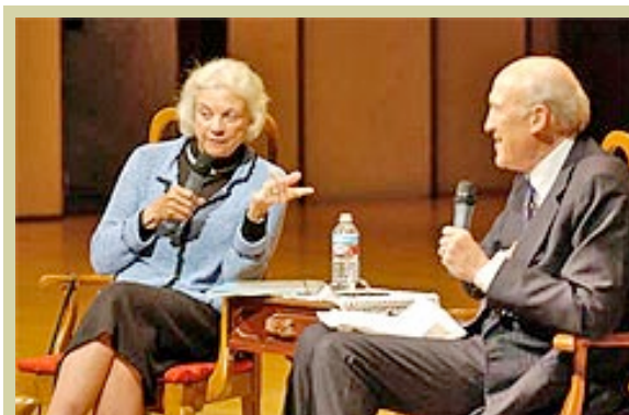
JUSTICE SPEAKS -- United States Supreme Court Justice Sandra Day O'Connor shared humorous stories with retired U.S. Sen. Alan Simpson during a presentation Tuesday at the University of Wyoming. O'Connor signed books and spoke to an overflow crowd in the Fine Arts Center concert hall. O'Connor became the Supreme Court's 102nd justice in 1981 after being nominated by President Ronald Reagan.