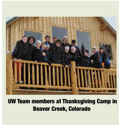
UW Team members at Thanksgiving Camp in Beaver Creek, Colorado

"This also informs our in-state Nordic skiers that they can come here and race against NCAA competition."