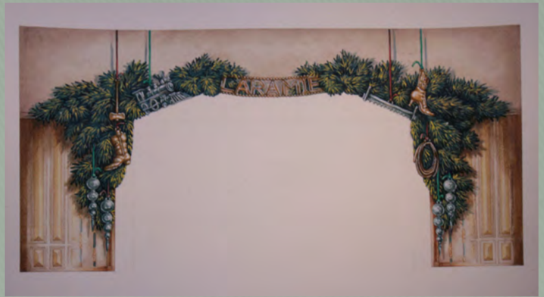
Ron Steger’s renderings of portals for the updated 2010 production of THE NUTCRACKER.

“We are presenting something very unique with this ballet. The beauty is in the details! We hope audiences enjoy it,” she added.