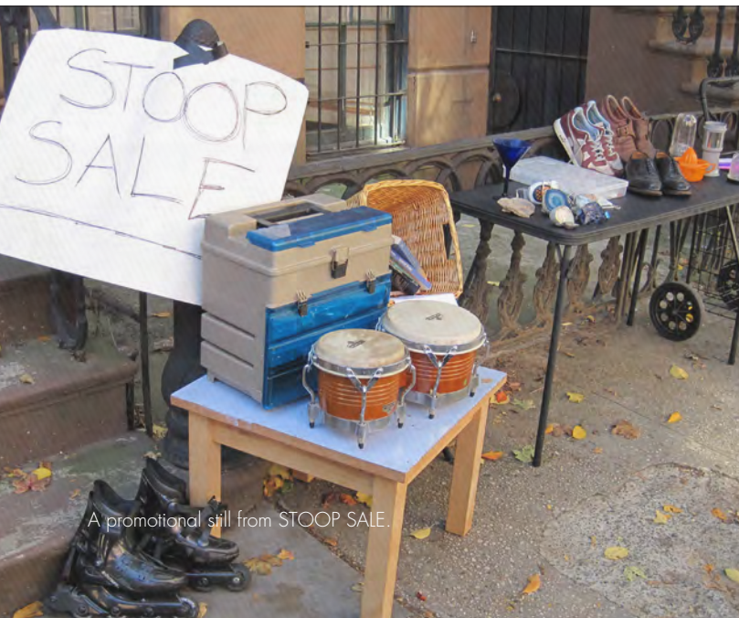
A promotional still from STOOP SALE .