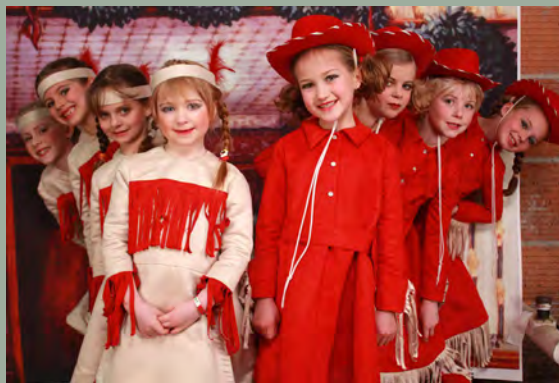
New Western-style costumes for the Gingersnaps in the updated version of UW's NUTCRACKER.