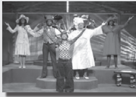
Unicorn Theatre's production of CROWNS .

appeared in CROWNS at the Unicorn Theatre and Gem Theater this spring and in INTIMATE APPAREL at the Unicorn Theatre in June. He also can be seen in the independent film SUSPENSION (for details, go online to www.suspension-movie.com ) and in an ad on the Sprint website at http://pictures.sprintpcs.com/publiclogin.do