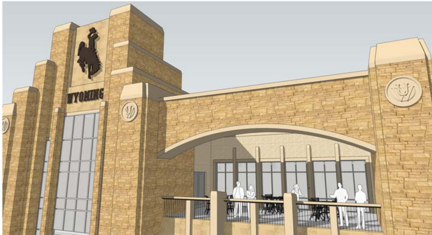
SOUTH ELEVATION - DETAIL

The University of Wyoming Board of Trustees' Report March 22-24, 2016 Page 204