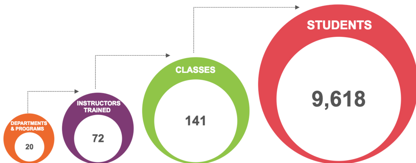
Figure 1: The reach of the LAMP over the course of 5 regular semesters and 3 summer semesters (summer 2016 – fall 2018). The first LAMP cohort of educators began training in the summer of 2016. Student numbers include a pilot active learning course taught in spring 2016. However, class and student numbers do not yet include community college data. Thirteen of the 72 fellows teach at five of our seven Wyoming community colleges: 2 faculty from Eastern Wyoming College (EWC), 6 faculty from Laramie County Community College (LCCC), 4 faculty from Northwest College (NWC), and 1 faculty member from Sheridan College. One graduate student trained in the 2016 cohort now teaches at Western Wyoming Community College. A majority of the classes (85 of 141) are lower division (gateway) courses.

LAMP Fellows receive intensive, year-long training in active learning. They develop instructional strategies that are implemented in their classrooms, assess the impacts on student learning and develop a teaching philosophy statement. The Fellows program has had a large impact on instructors, courses and students at the University of Wyoming and at five of the Wyoming Community Colleges.