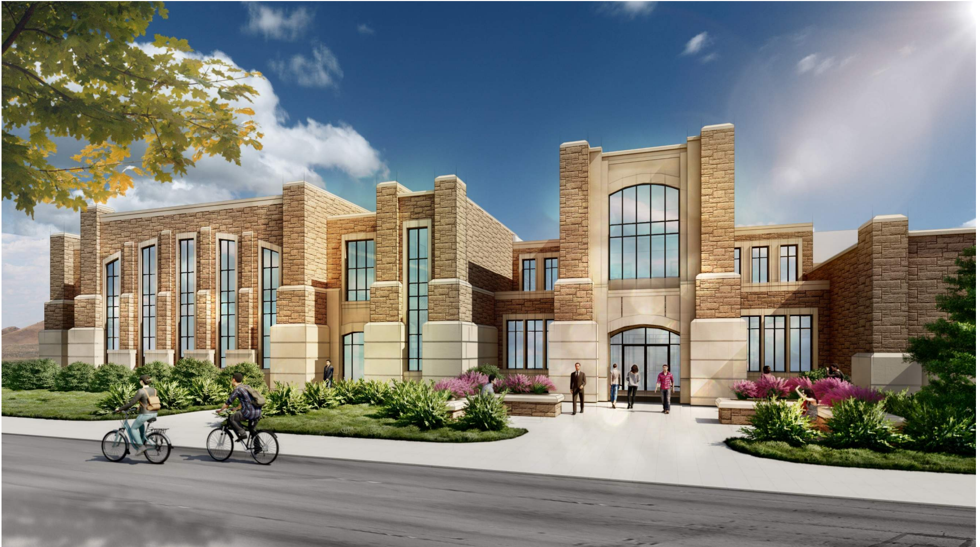
View – New Main Entry