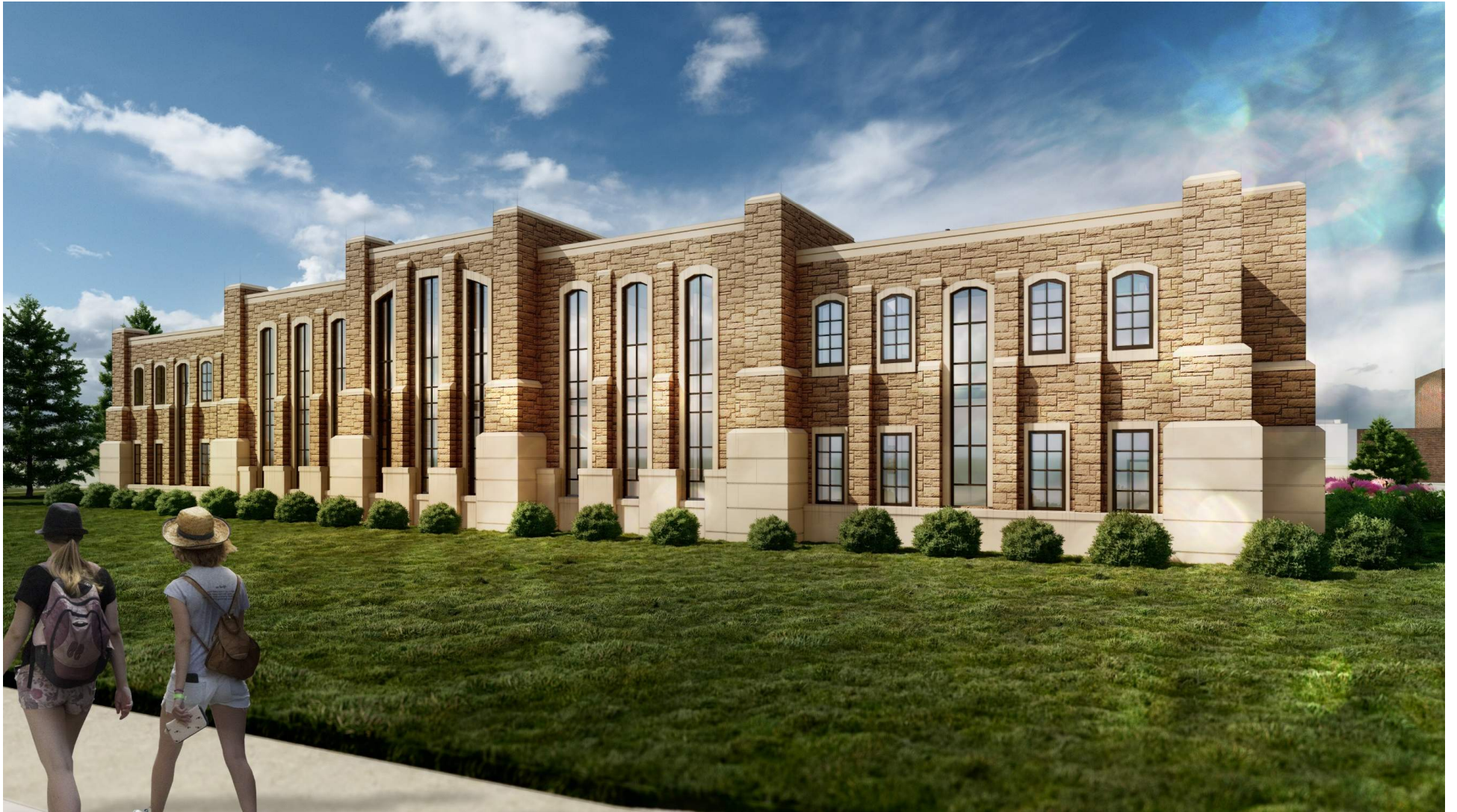
View - from North on Willett