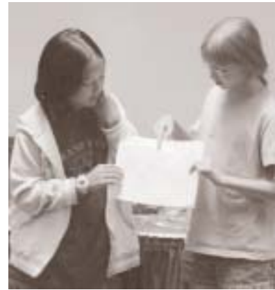
These international 4-H and Labo friends make a presentation about Japanese volcanoes.