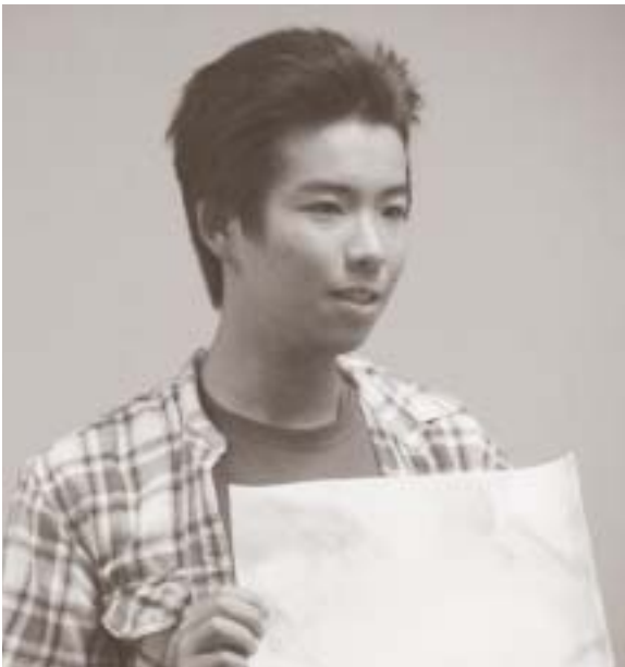
This exchange visitor shares a drawing depicting parts of his country.