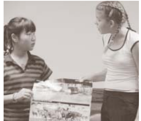
Japanese and American girls discuss the animal populations of their countries.