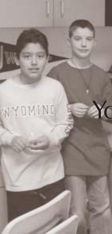
These students operated a pet store to try to earn money.