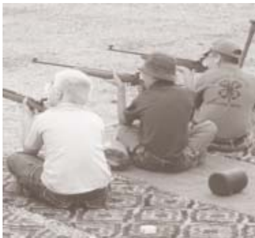
Young 4-H members are introduced to shooting sports through small rifles.

He adds, "I would recommend it to anybody who has an interest in shooting or in just gaining more mental control. It's a lot of fun, but it's a safe activity at the same time."