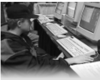
The WEST offered something for everyone. People of all ages were offered an opportunity to experience new technologies first-hand.