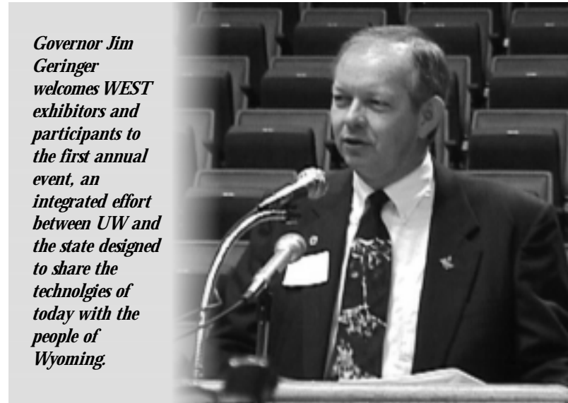
Governor Jim Geringer welcomes WEST exhibitors and participants to the first annual event, an integrated effort between UW and the state designed to share the technologies of today with the people of Wyoming.

Representatives from nine different states were present, comprising 82 separate exhibitors and filling approximately 150 booth spaces. Corporations including Caterpillar and Norwest Banking made appearances as well as local internet service providers, clothing manufacturers, construction companies, government, state, and environmental agencies, and more. Many presenters provided the general public hands-on experience and new technology demonstrations. One of the more unique and