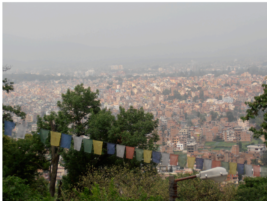
Kathmandu from Monkey Temple