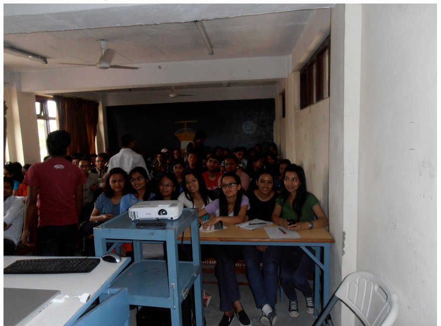
Classroom pre-lecture KIST