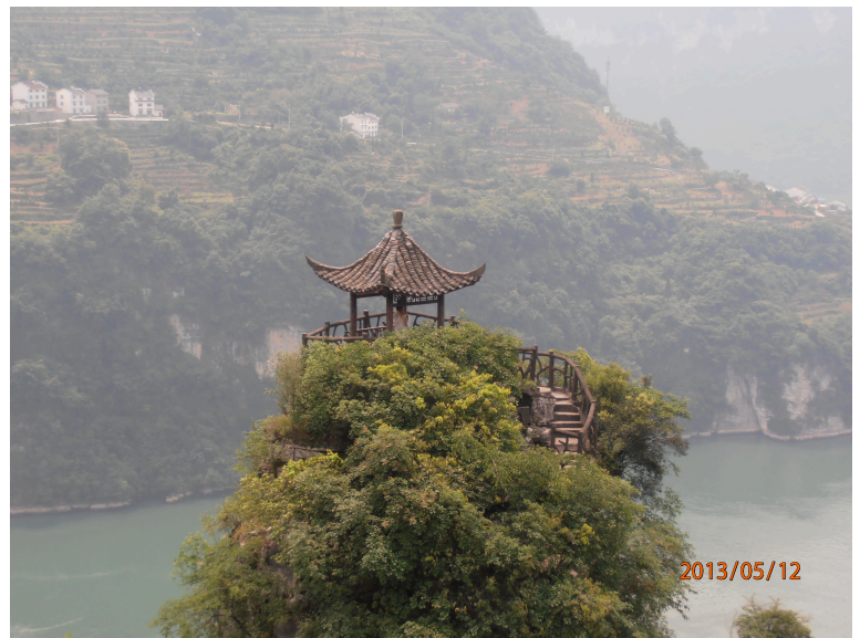
Temple above Yangtze River Three Gorges China