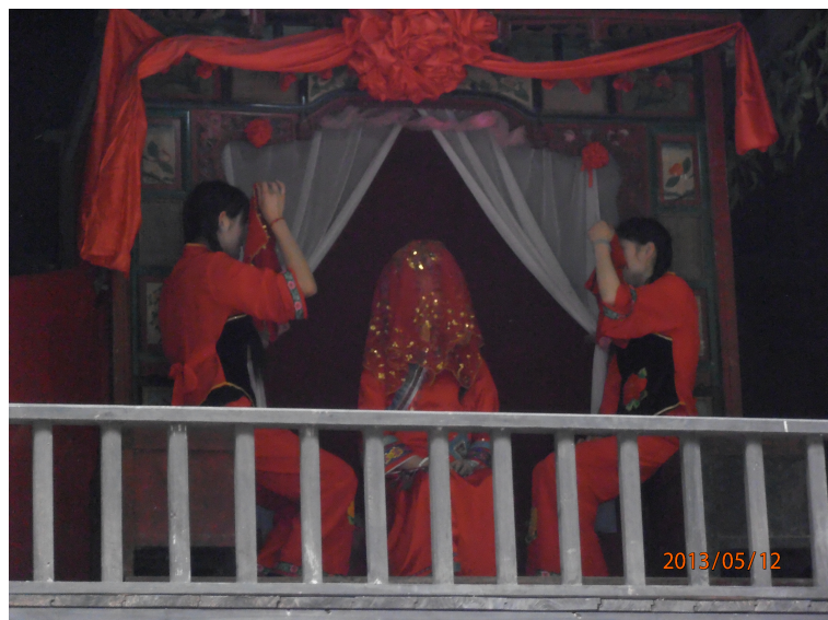
Ancient wedding Ceremony , Three Gorges China