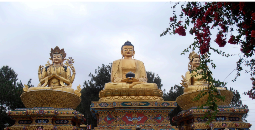
Buddhas at Monkey Temple