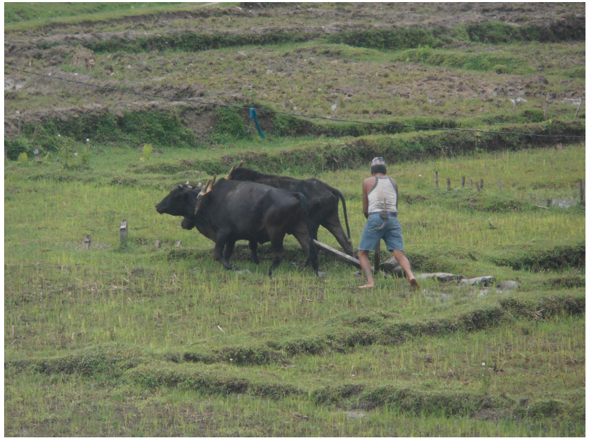
Working the fields the hard way, Pokhara