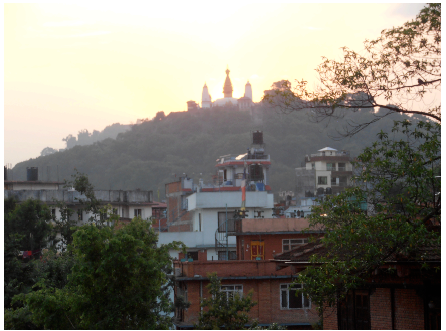
Sundown at the Monkey Temple, Kathmandu Nepal