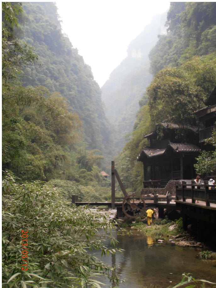
Three Gorges China