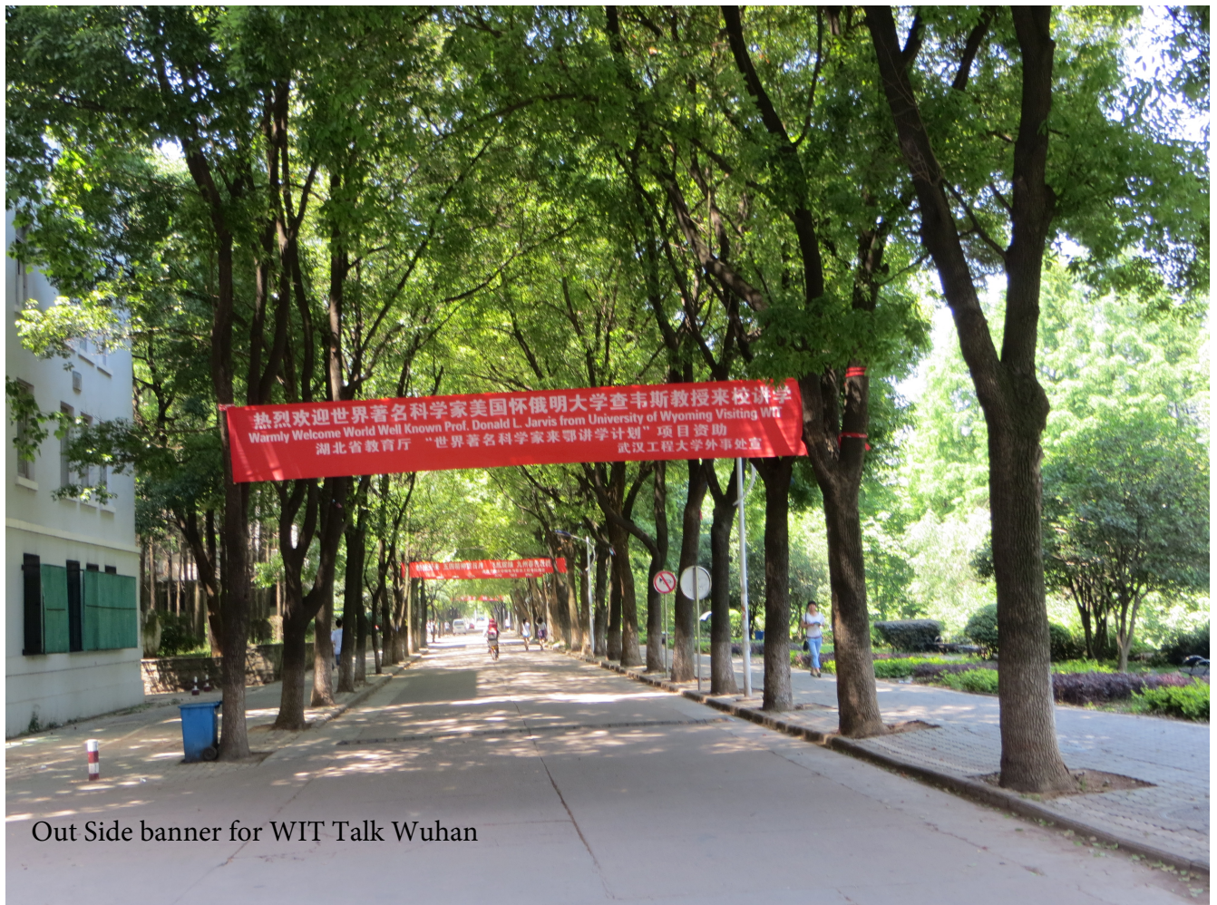
Out Side banner for WIT Talk Wuhan