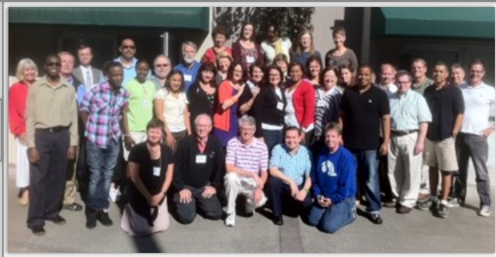
Last year's symposium attendees, having more fun than should be allowed

We are pleased to announce the opportunity to study the Agenda for Education in a Democracy (AED) again this summer in Seattle. The executive board is developing a new week-long summer symposium for those who have not had the opportunity to participate in year-long leadership programs or other NNER initiatives and who are interested in learning more about the Agenda and how to apply its principles in their work and the NNER mission. Activities and interaction will be developed using evaluation information from previous symposium participants. The symposium will provide opportunities to meet with colleagues from across the NNER, discuss issues pertinent to the health of our public schools, universities, and communities, and to study and interact with NNER leaders committed to advancing the AED.