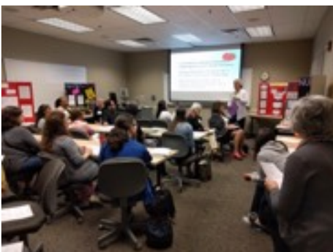
One of 39 presentations