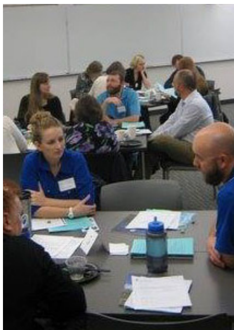
Participants discuss active learning at the 2015 Life Sciences Lost in Transition Summit in Casper. Next year will mark the 10th anniversary of the Life Sciences K-16 summit.

Sheridan College Museum encourages community science involvement; Calendar of upcoming events Page 12