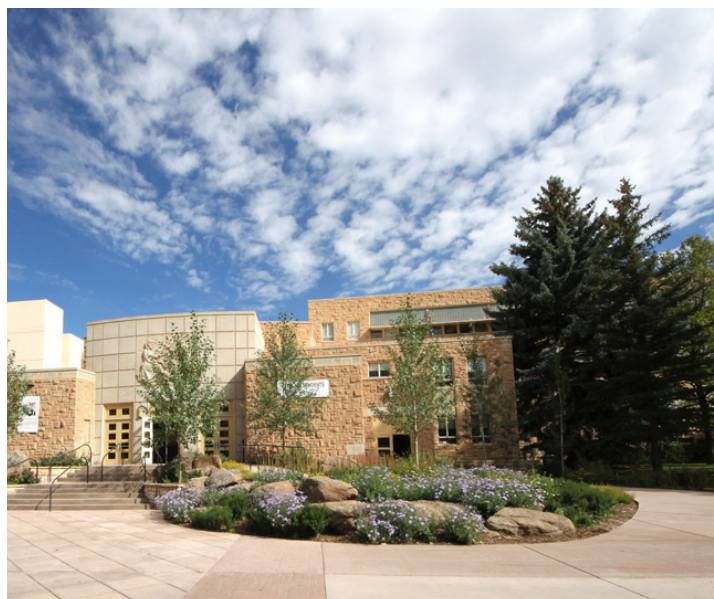
Pictured above is the University of Wyoming's College of Education building. The college is bringing to the UW campus five candidates who are interviewing for the position of dean of the College of Education.

The committee is seeking feedback from the Wyoming community about the candidates. To share your impressions of candidates with the committee, please visit http://www.uwyo.edu/