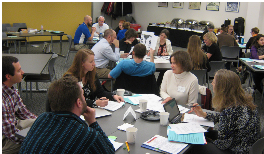
Participants at this year's Life Sciences Lost in Transition Summit discuss active learning. To be part of the continued conversation, join the K-16 Life Sciences Teaching Community WyoGroup online, http://www.uwyo.edu/wsuf/lost%20in%20transition/science.html

A few instructors indicated that it can be a challenge to convince other teachers to include active learning opportunities. In some instances, students can be resistant to active learning, expecting instead to be taught in a more traditional manner. How can we help instructors and students recognize the value of active learning, which provides unique ways of