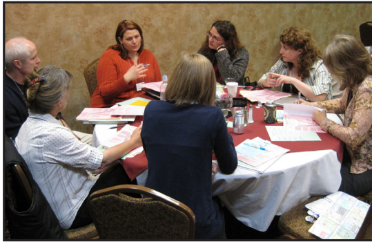
Administrators and faculty from K-12, post-secondary, and state education agencies meet at the World Languages Institute.