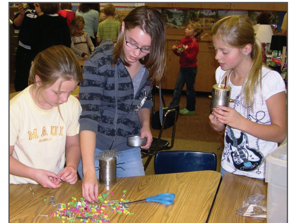
Students of different ages work together to accomplish their art project.

Implementing statewide, collaborative, and simultaneous improvement of teacher education and the renewal of schools.