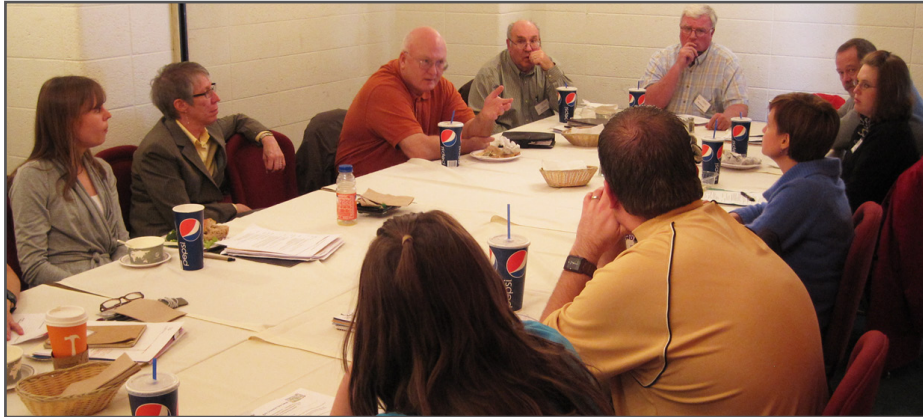
Carbon County School District #2 teachers and administrators meet with UW Life Sciences faculty during the Site Swap Program.

The site swap is part of the high school to higher education transitions initiative to increase student success as they move from high school to college.