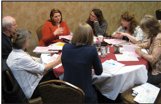
Administrators and faculty from K-12, post-secondary, and state education agencies meet at the World Languages Institute.