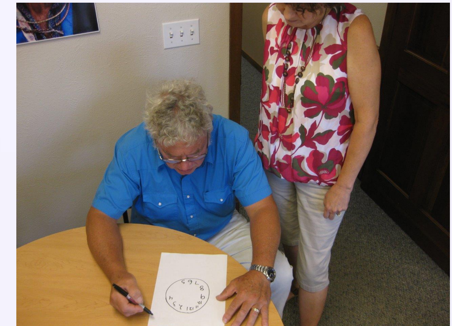
In-Home Services Case Managers practice administering and scoring the Mini-Cog™