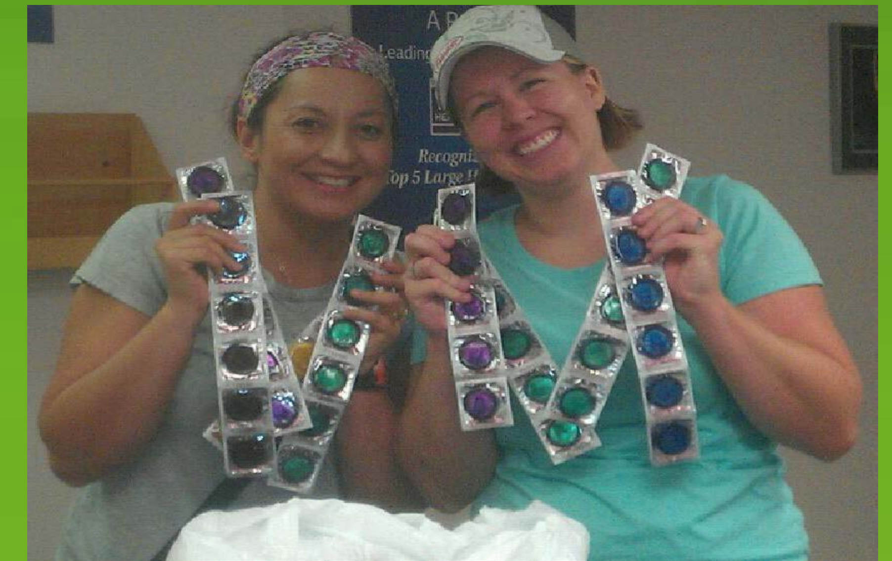
Photo of local contacts installing the dispensers.