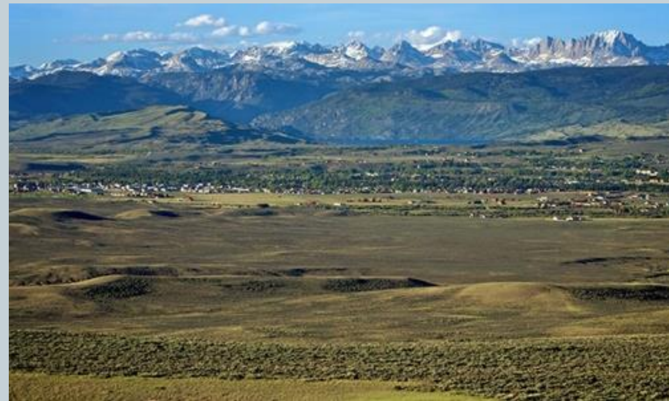
Pinedale, Wyoming at the base of the Wind River Mountains.

The purpose of this intervention is to increase sexual education and knowledge of STD testing resources in Pinedale, Wyoming in hopes of decreasing rates of STDs and teen pregnancy.