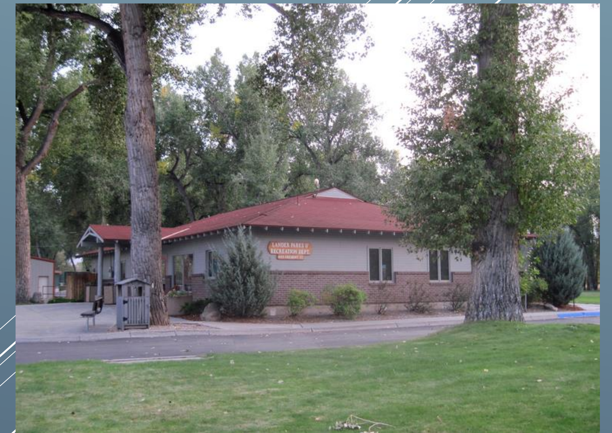
Lander Parks and Recreation Department