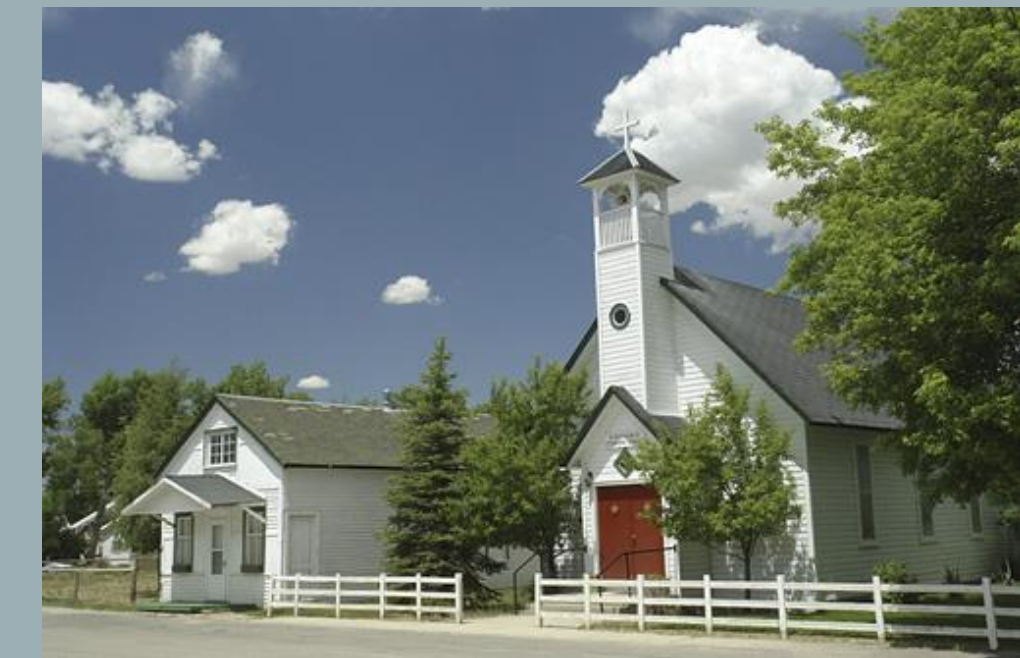
St. Barnabas Episcopal Church in Saratoga