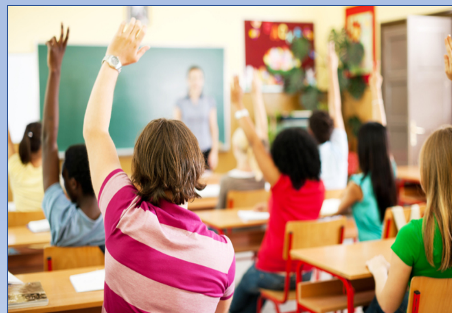
Education programs create the opportunity for the youth to begin to make informed health choices