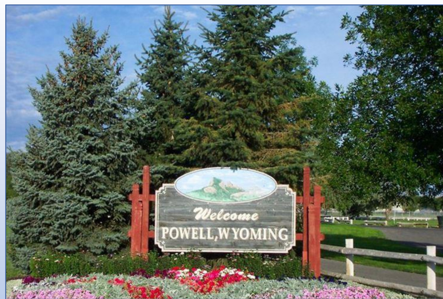
Welcome to Powell, Wyoming

Using targeted vaccination education, providing a platform to discuss concerns about vaccinations, and increasing access to vaccinations through a community-based program will improve vaccination rates throughout the community.