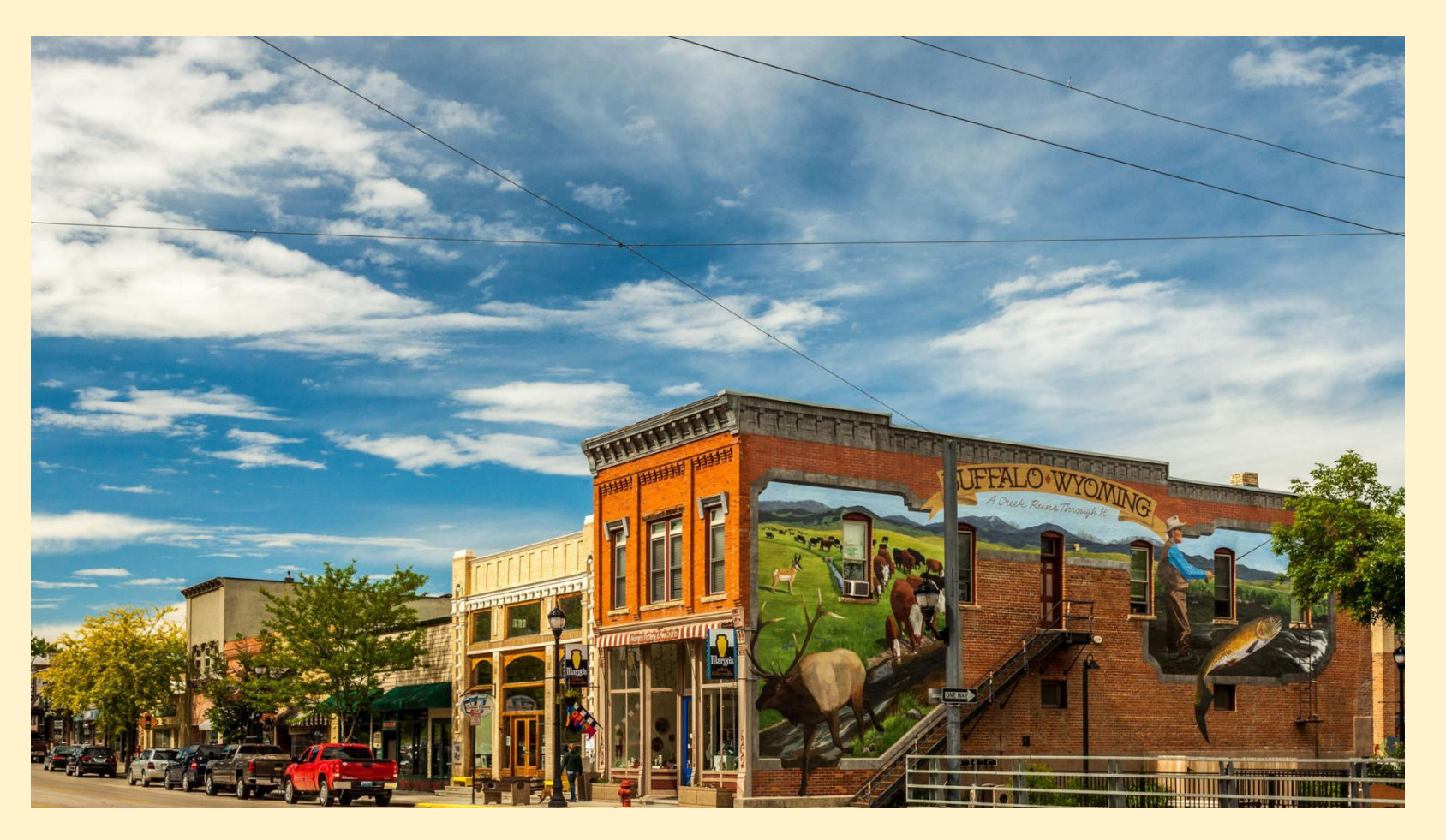
Downtown Buffalo, Wyoming