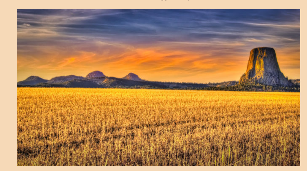
Devils Tower northeast of Gillette