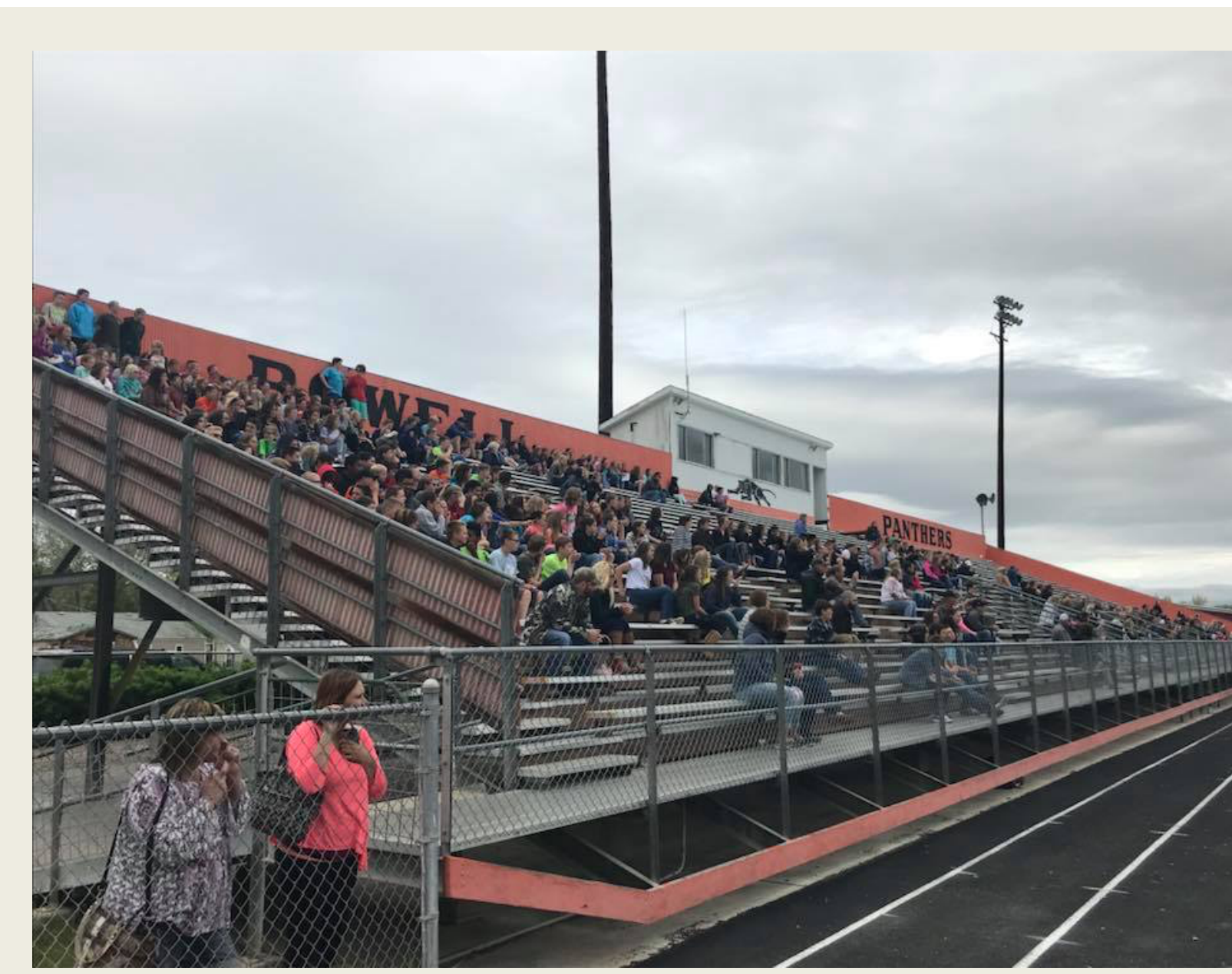
Target audience: Powell Middle School students