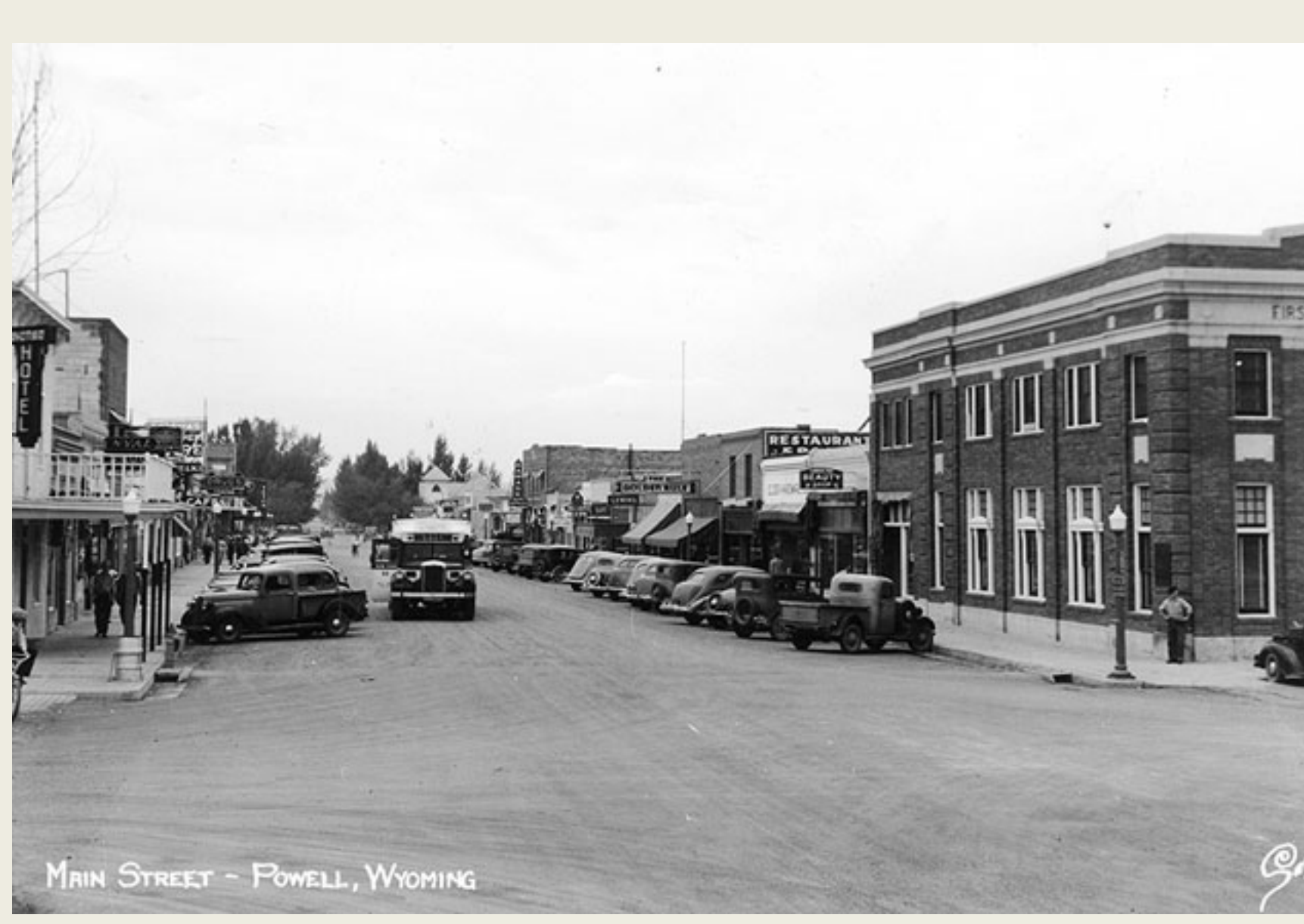
Downtown Powell 1942