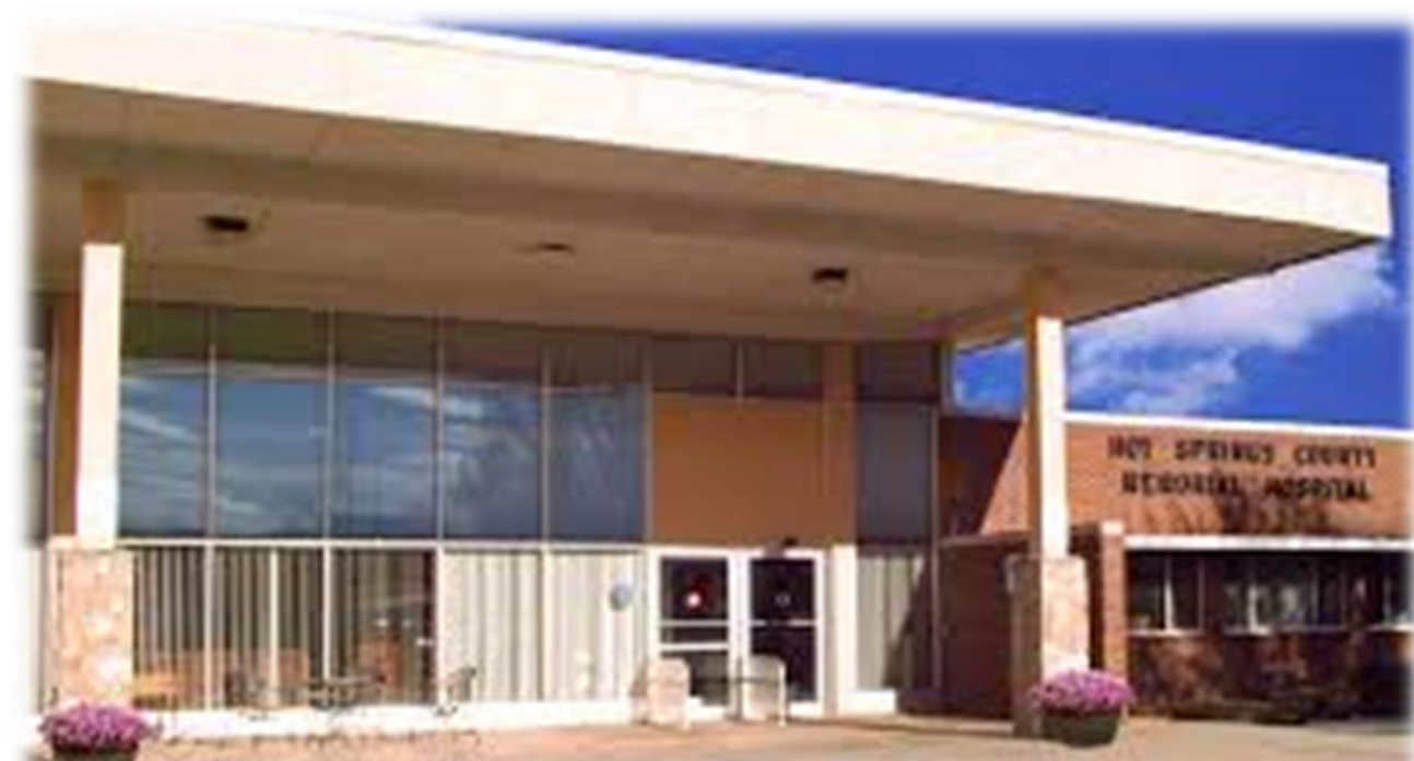
Hot Springs County Memorial Hospital