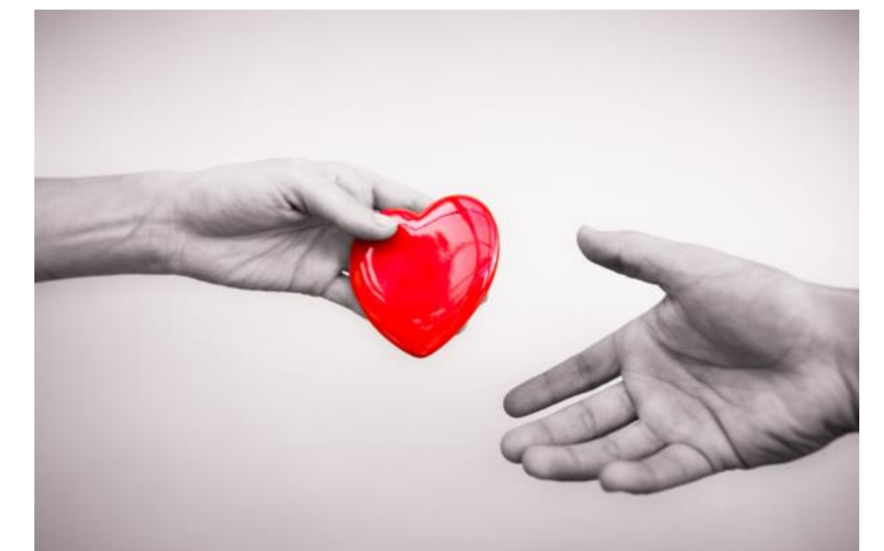
Bereavement photography from NILMDTS

Acknowledgements: Wellsprings Counseling, HSCMH, local healthcare providers