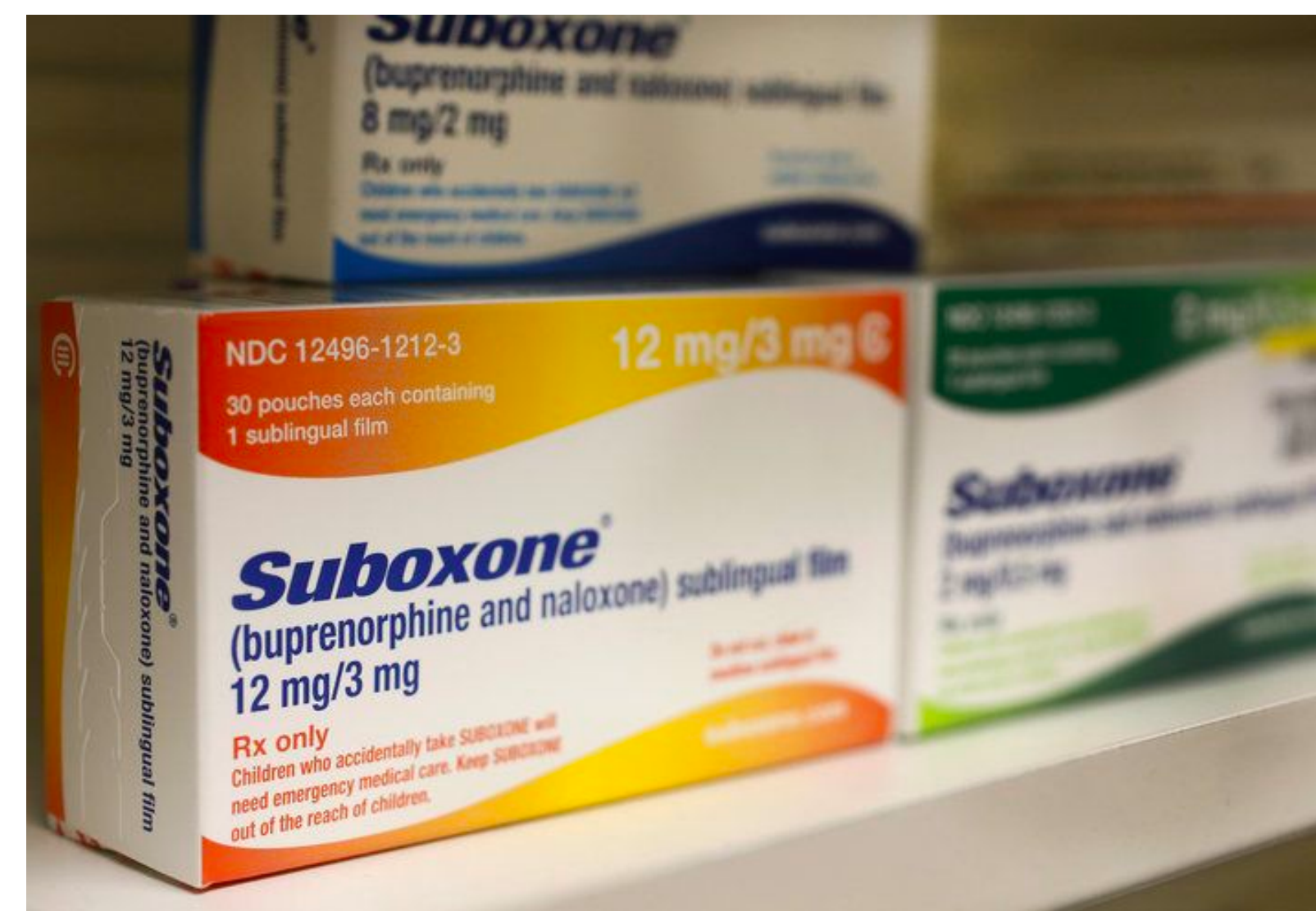
Brand name buprenorphine-naloxone used to treat both heroin and synthetic opioid dependence