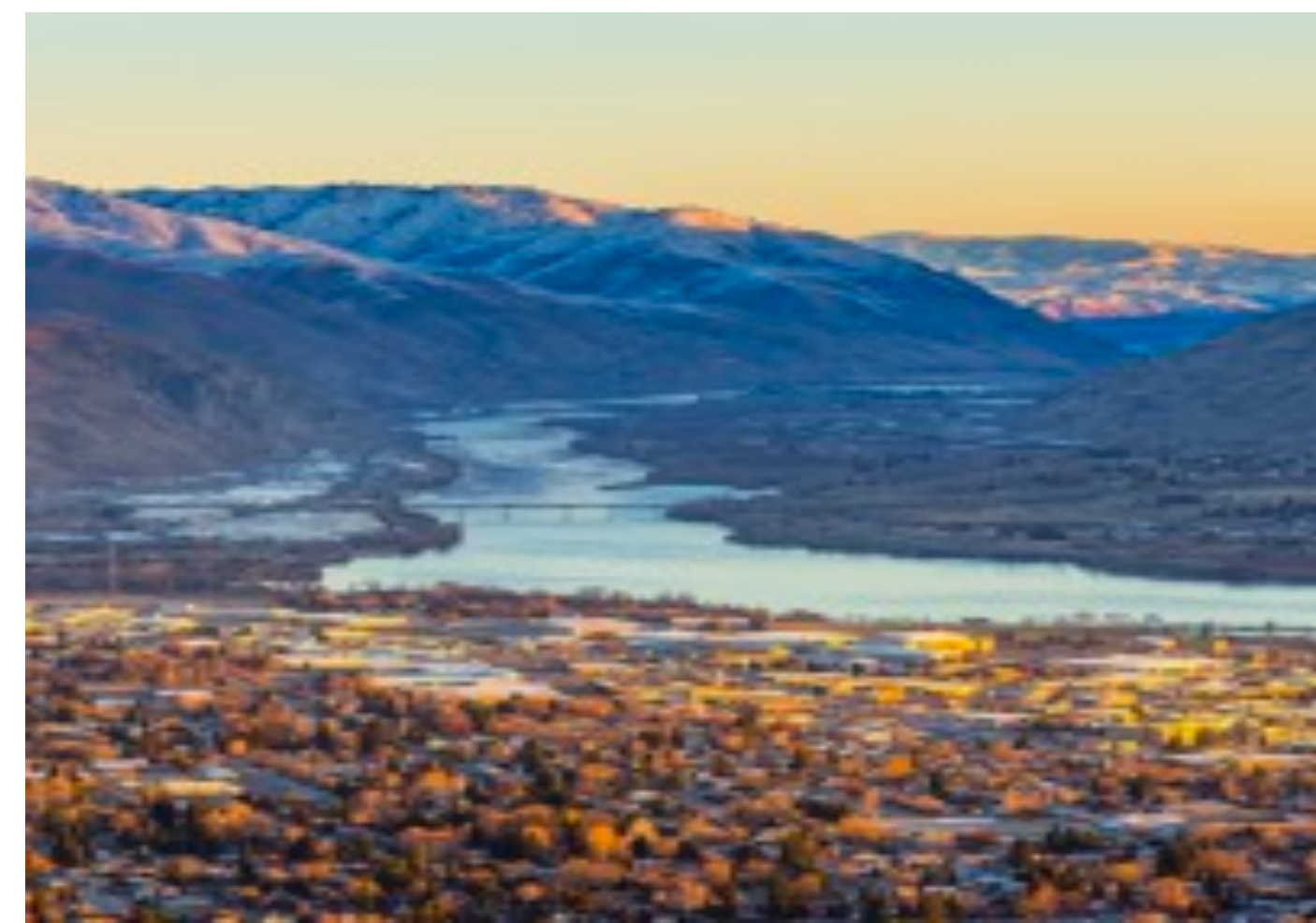
Wenatchee, Washington, located along the Columbia River at the eastern foothills of the Cascade Range