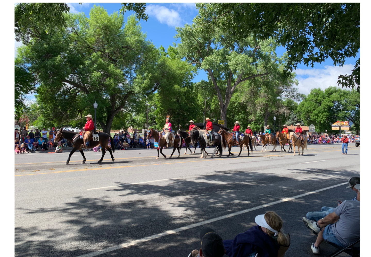
100 th Anniversary Stampede Parade in Cody