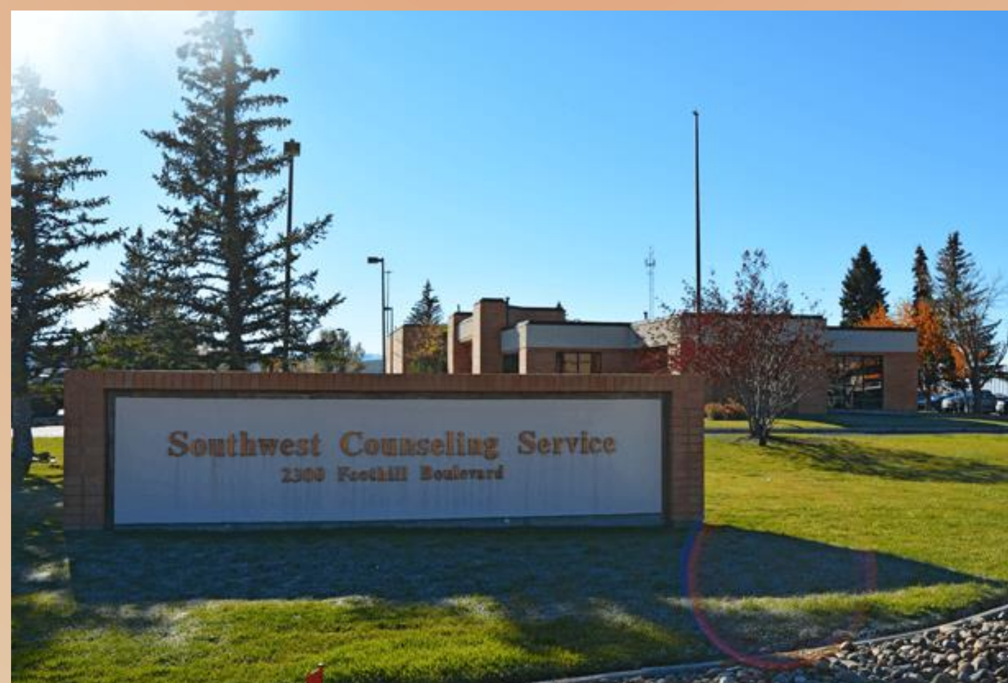
Southwest Counseling Services Rock Springs Wyoming