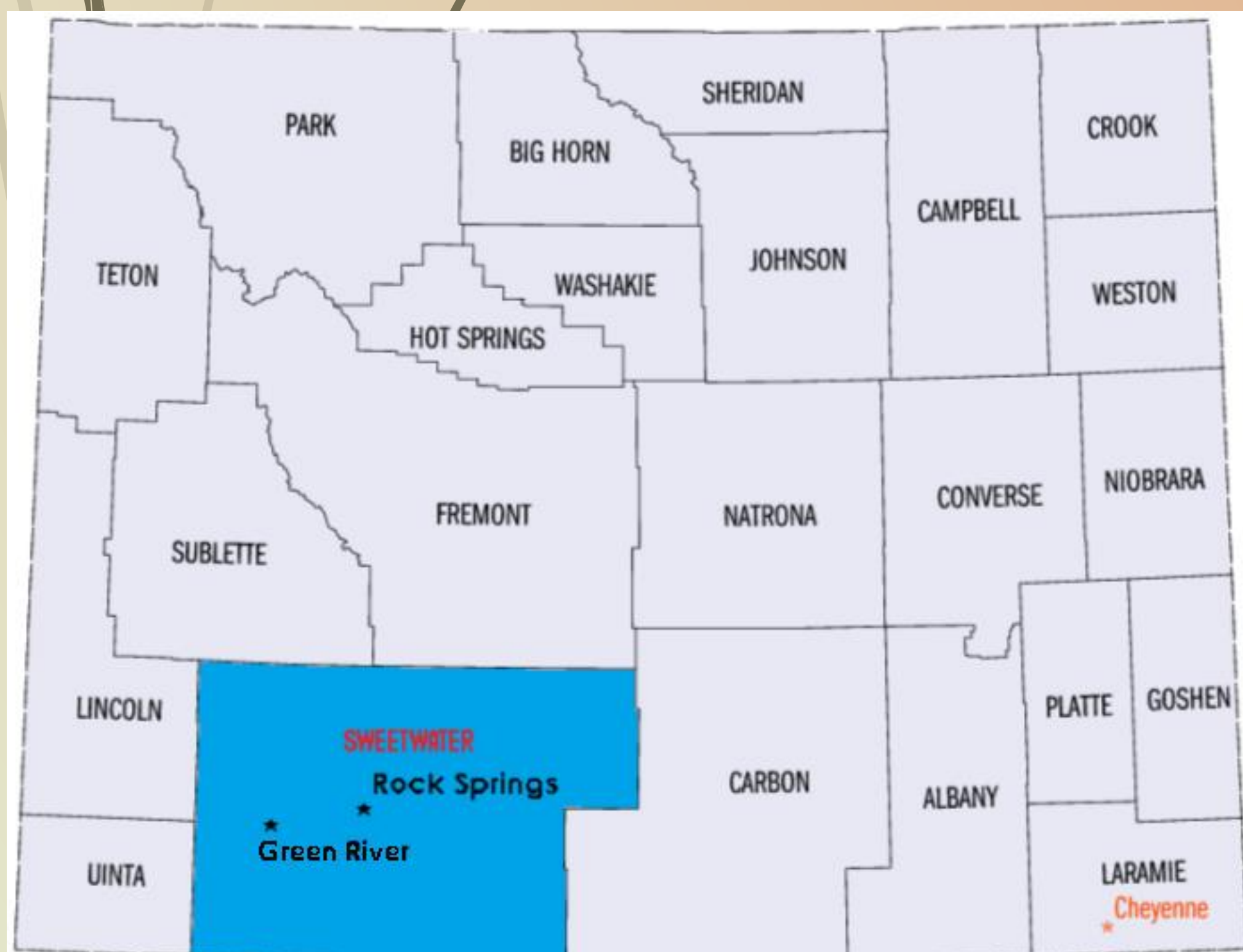
Sweetwater County in Wyoming