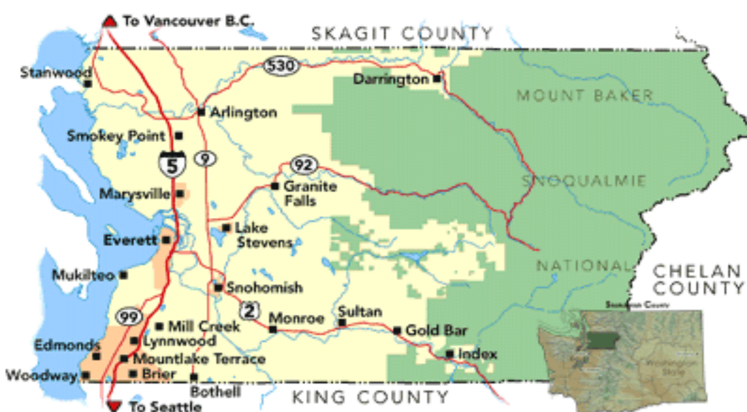
Map of Snohomish County, WA from Snohomish County, Washington government.