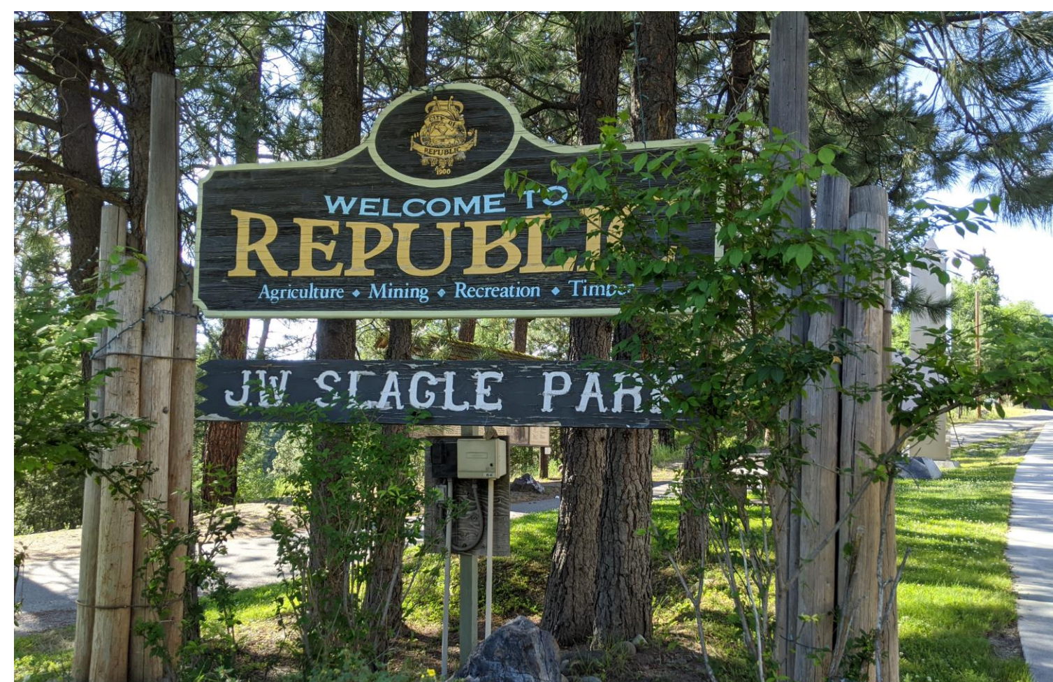
Welcome sign entering Republic, WA Largest town in Ferry County at ~1000 residents