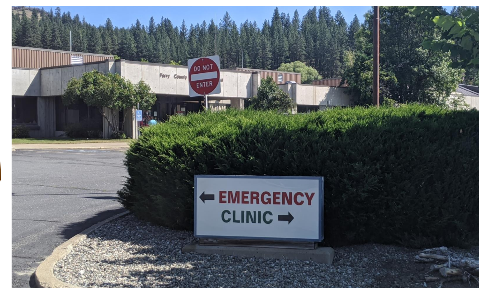
Entrance to Ferry County Health Complex in Republic, WA