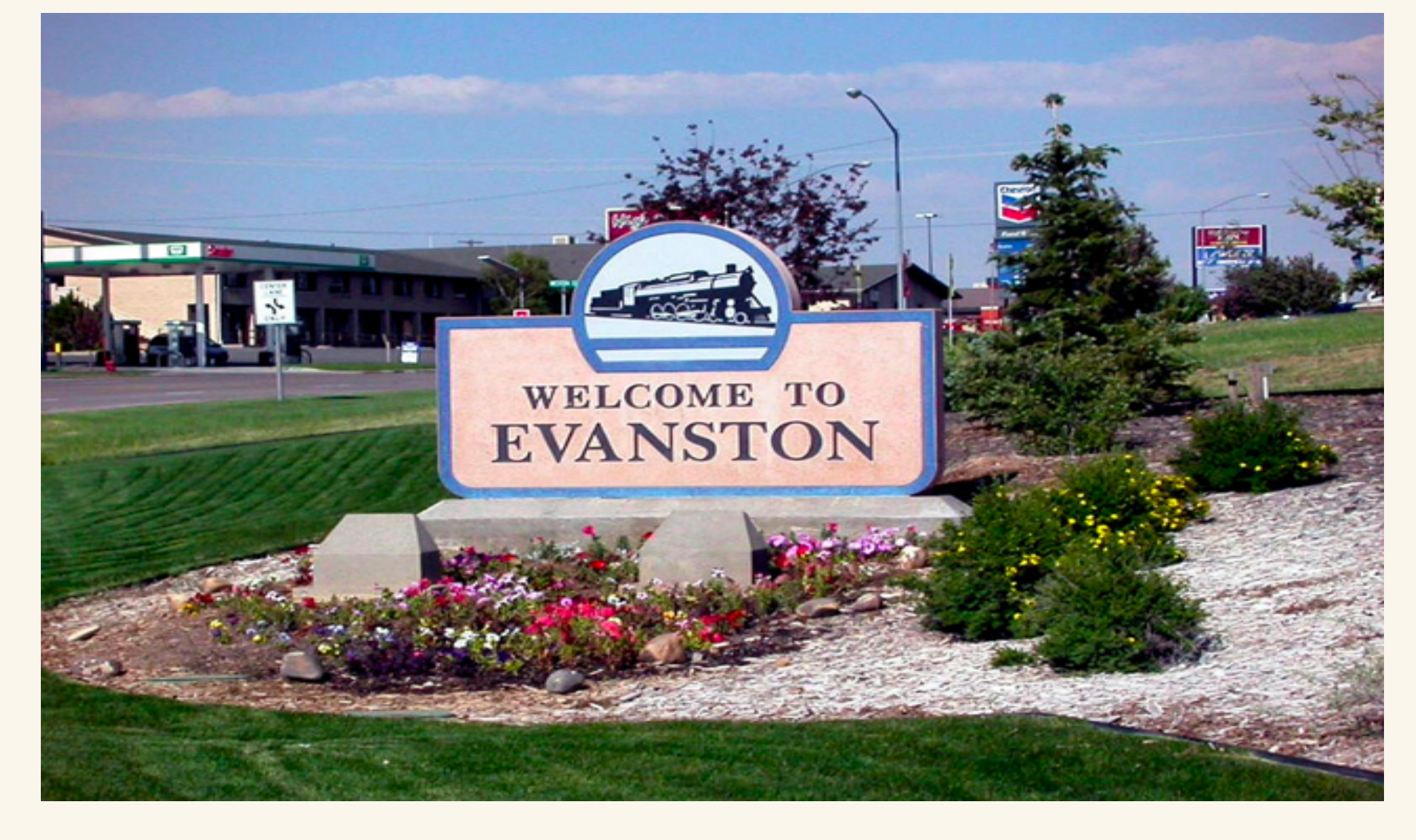
Welcome Sign in Evanston, WY