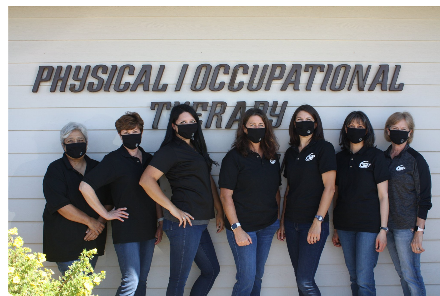
Staff members posing out front of Gottsche Therapy