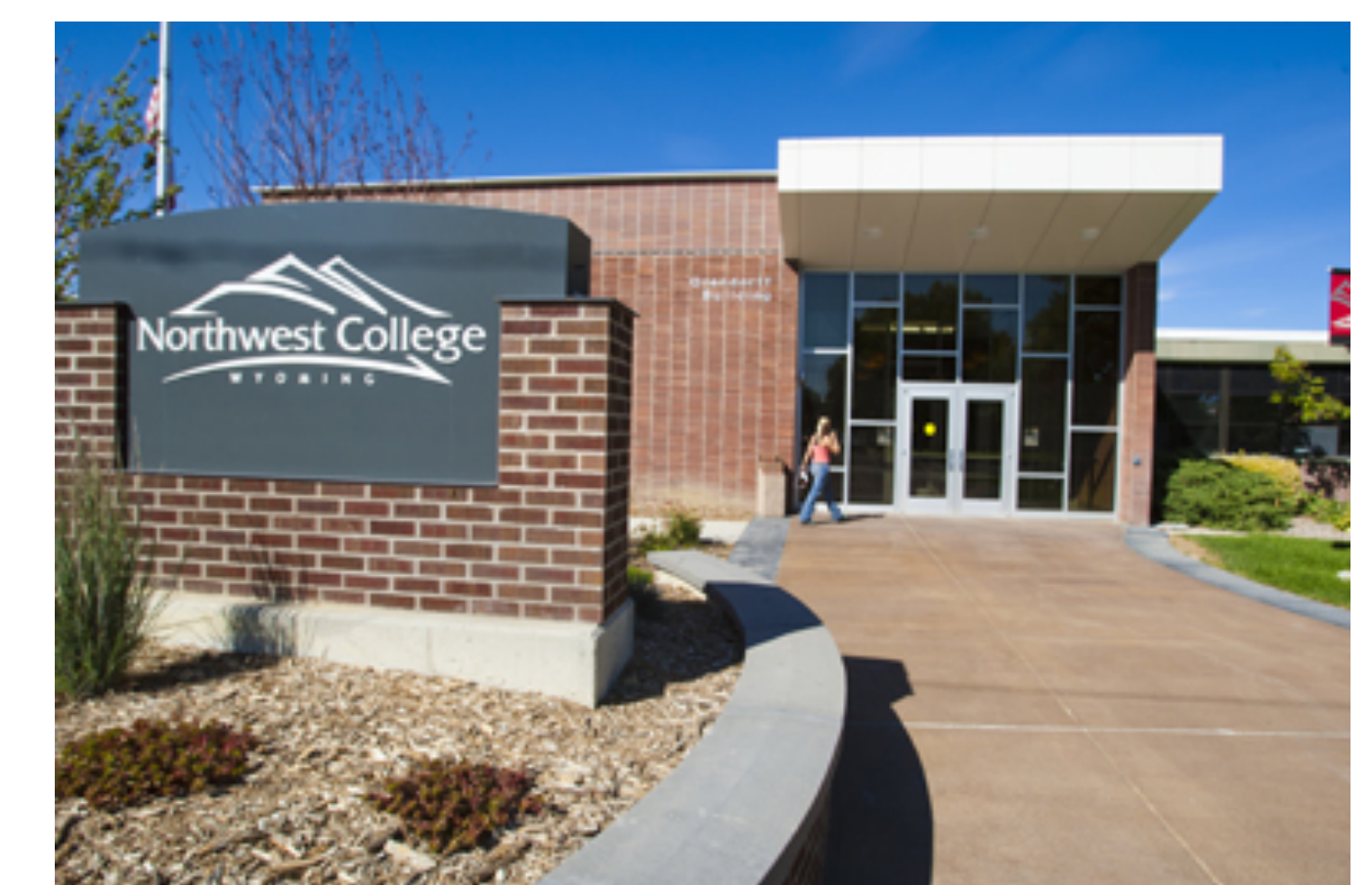
Northwest College located in Powell