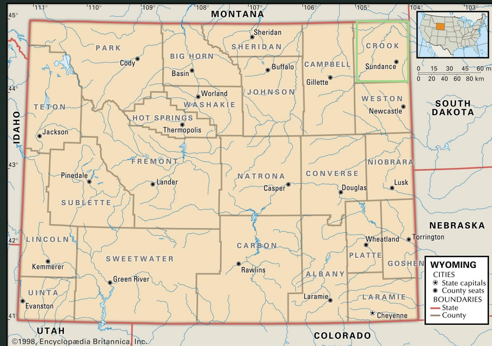
Map of Wyoming: Crook County outlined in green

Increase diabetes nutrition education in those with type II diabetes through teaching patients how to use the Diabetes HealthSense website.