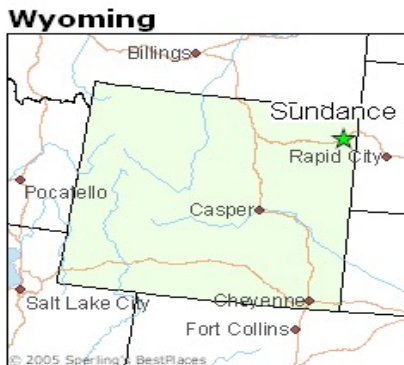
Map of Wyoming, (BestPlaces.com, 2021)