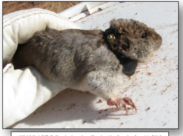
AVM Mini-BT Collar deployed on T. talpoides female, Oct. 14, 2010.

using the receiver without the antenna, the location of the gopher could be determined to within 20cm. Nevertheless, there are some significant setbacks in the deployment of these collars. The collar design is bulky and cumbersome and attachment involved an inordinate amount of fitting and adjusting leading to excessive stress on the animal. In addition,