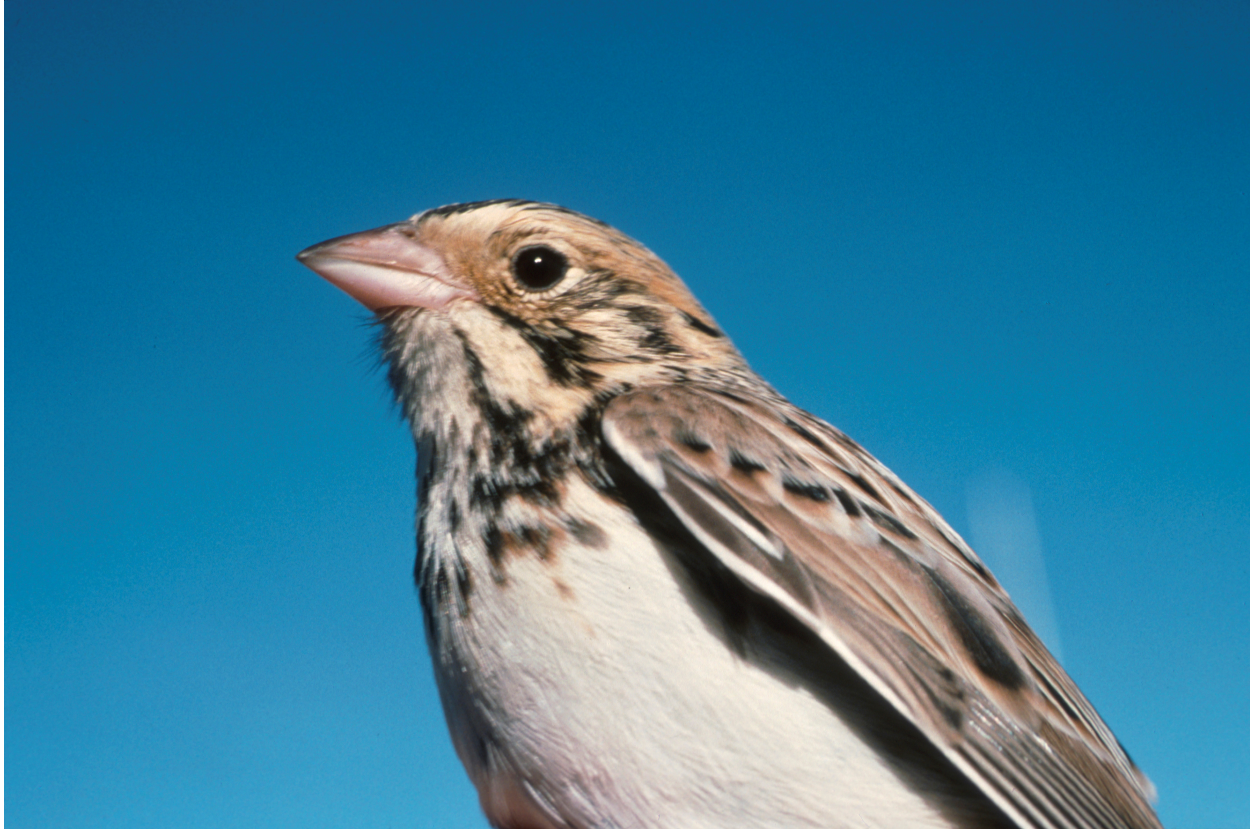
Figure 1: Photo of Baird's Sparrow.