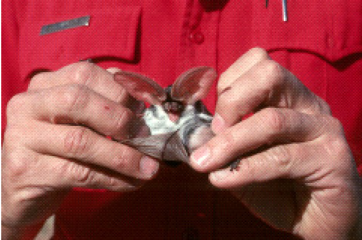
Figure 1. Photo of first Euderma maculatum captured in Wyoming.