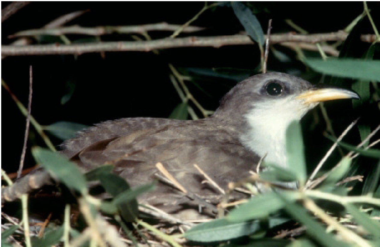
Figure 1. Yellow-billed Cuckoo on nest. Photograph from South Fork Kern River Valley, California, by Ian Tate.