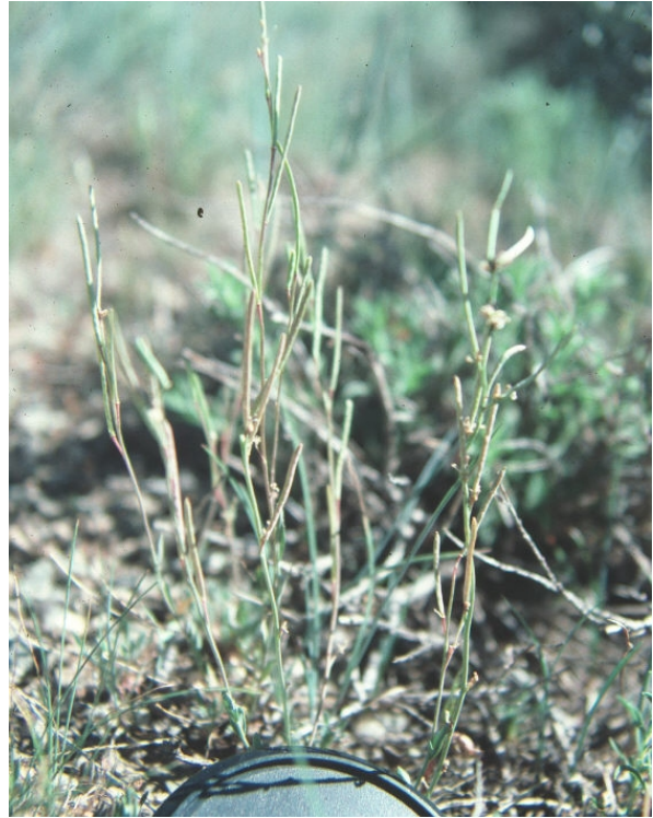
Above: A. williamsii var williamsii

Abundance: Colonies tend to be large, ranging from ca 100 to several hundred individuals. Total population may be from 2000-5000.