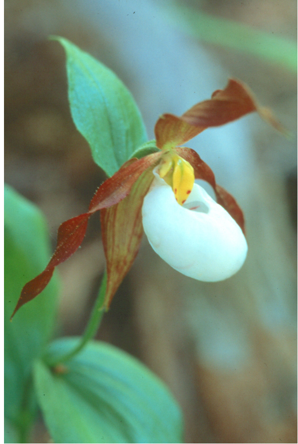
Above: Cypripedium montanum

Distribution: Alaska to central California, east to Alberta and Wyoming. In Wyoming it is known from the Bighorn Mountains in Johnson and Sheridan counties.